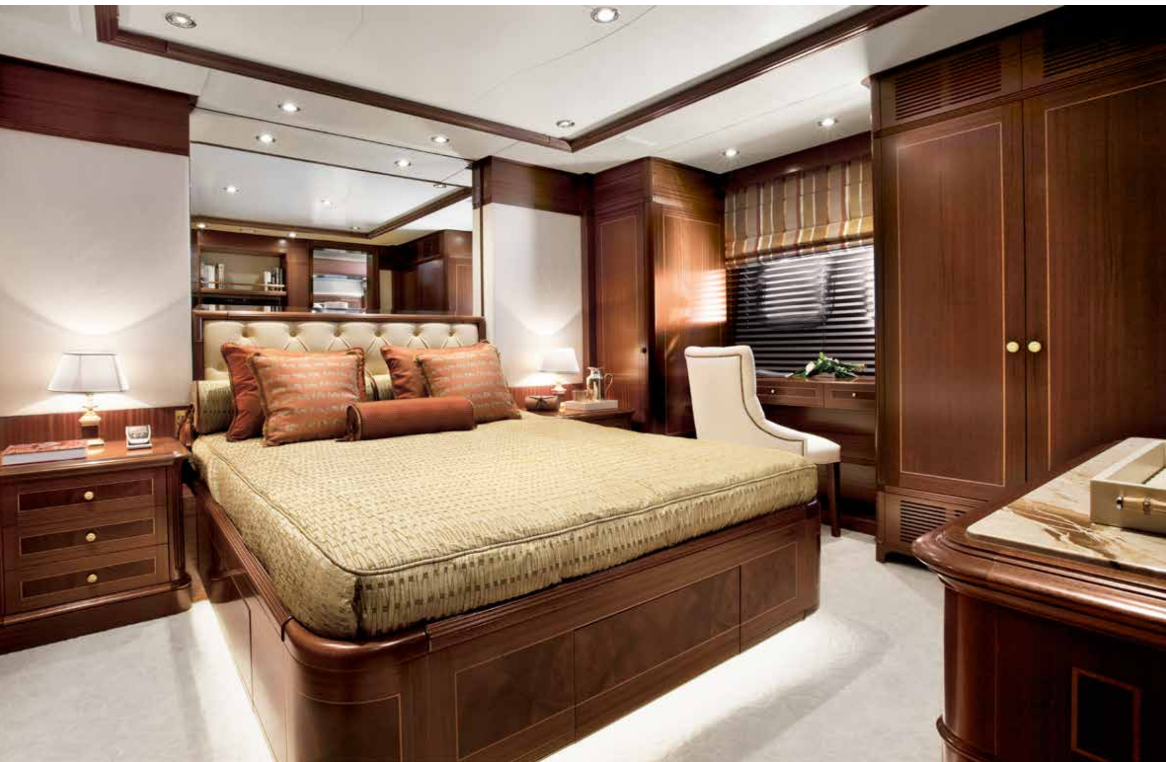
Lower Deck Vip Cabin

Crystal 140' also makes sure that guests have plenty of space to rest in. The carefully arranged layout of the lower deck offers four spacious cabins, two with double beds and two with bunk beds. The thickness of the partitions (mounted on tracks fitted to silent block mechanisms that absorb all vibrations), the materials used and a carefully designed layout ensure the utmost silence and privacy in every cabin.