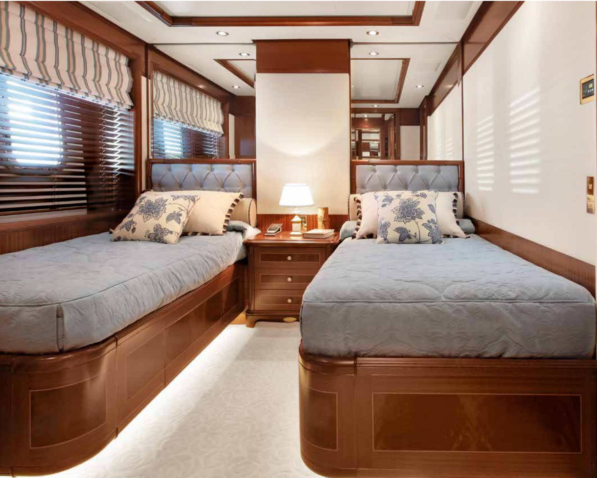
Lower Deck Twins Cabin