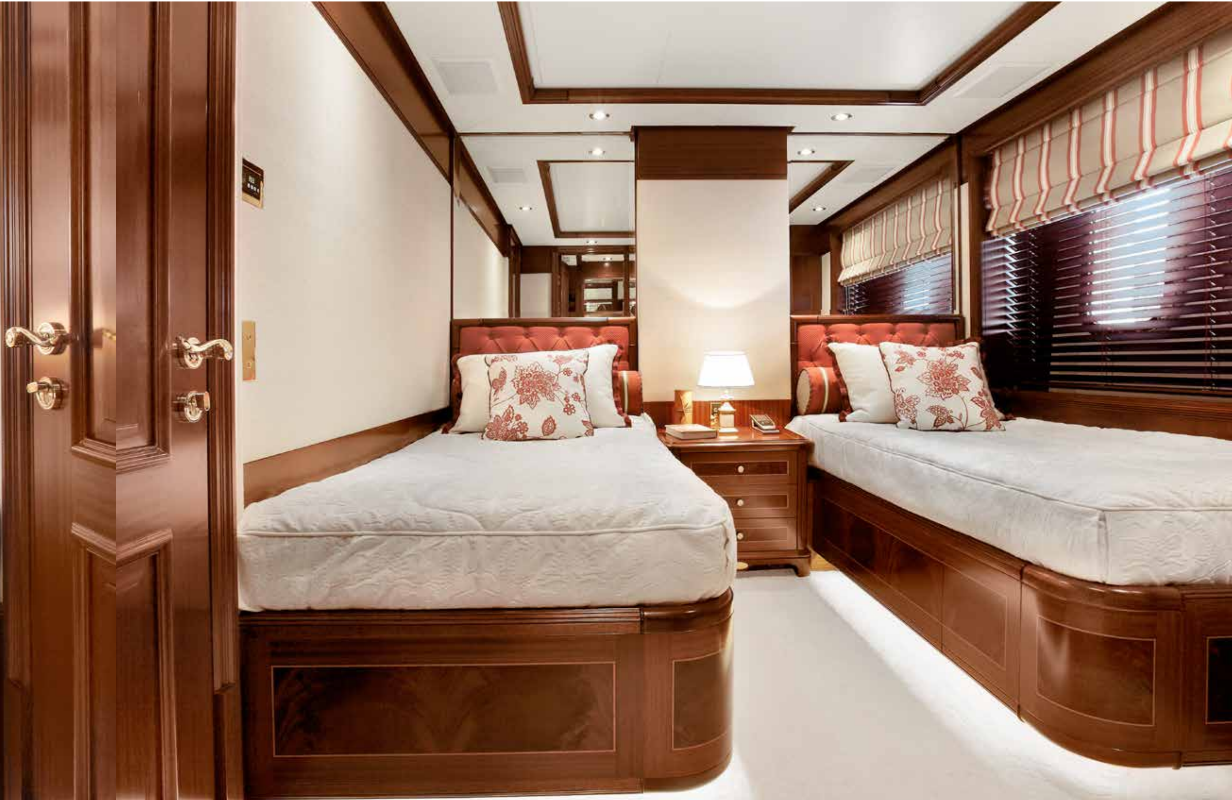
Lower Deck Twins Cabin