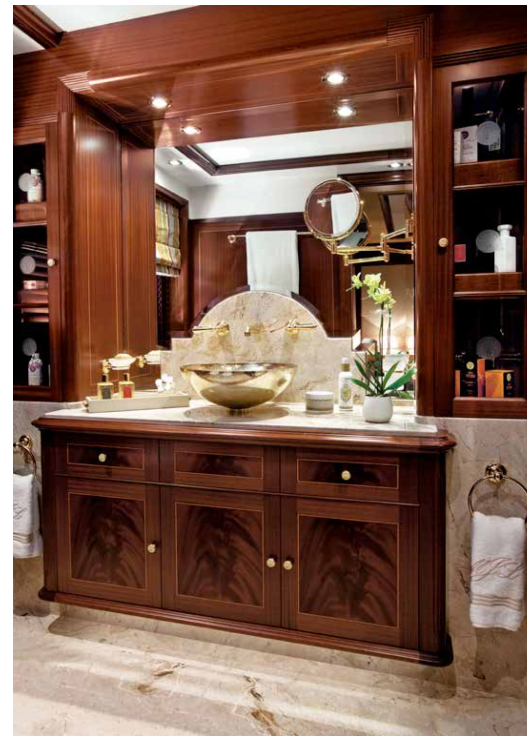
Lower Deck Vip Bathroom

Crystal 140' also makes sure that guests have plenty of space to rest in. The carefully arranged layout of the lower deck offers four spacious cabins, two with double beds and two with bunk beds. The thickness of the partitions (mounted on tracks fitted to silent block mechanisms that absorb all vibrations), the materials used and a carefully designed layout ensure the utmost silence and privacy in every cabin.