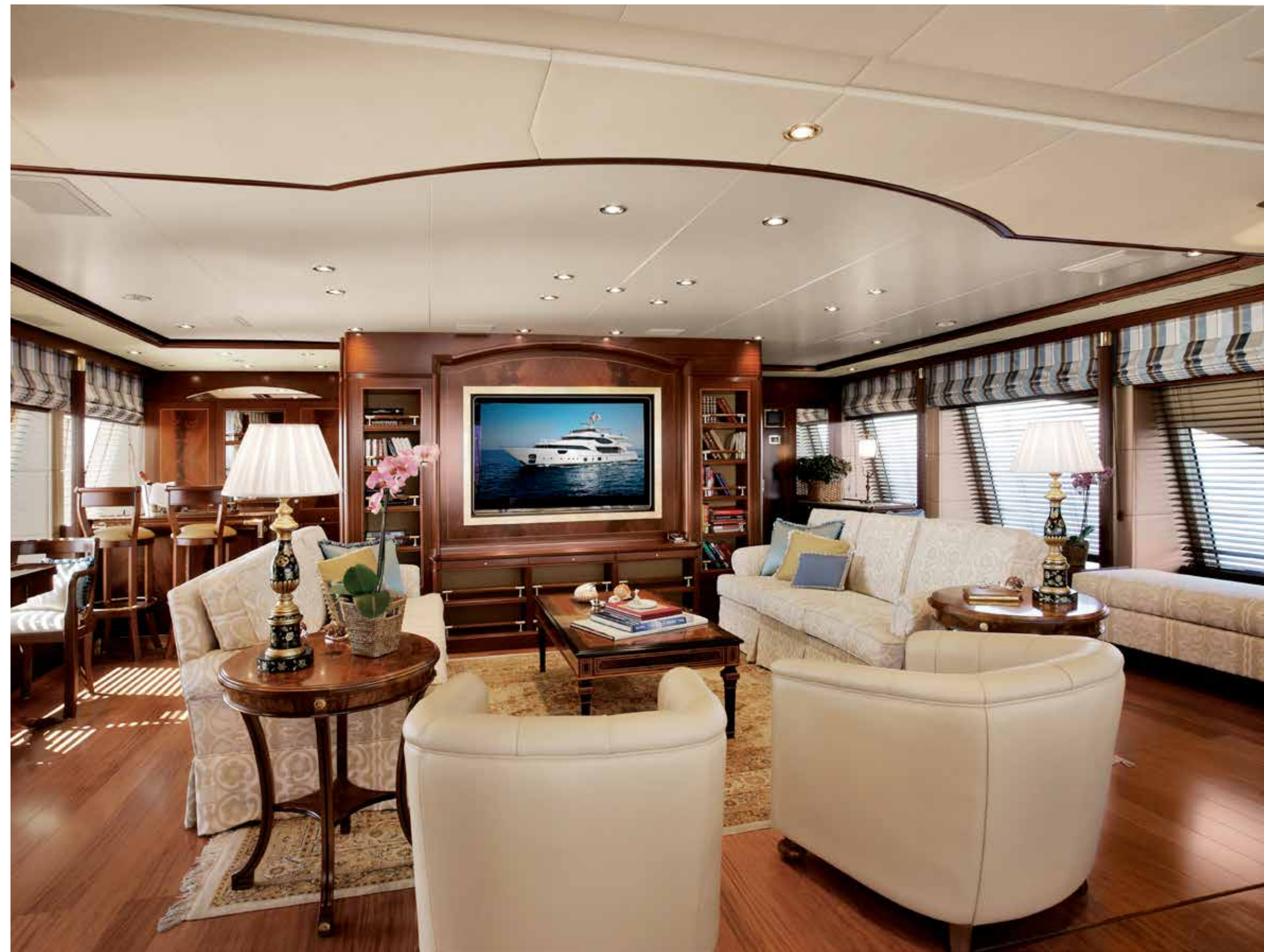
Upper Deck Living Area