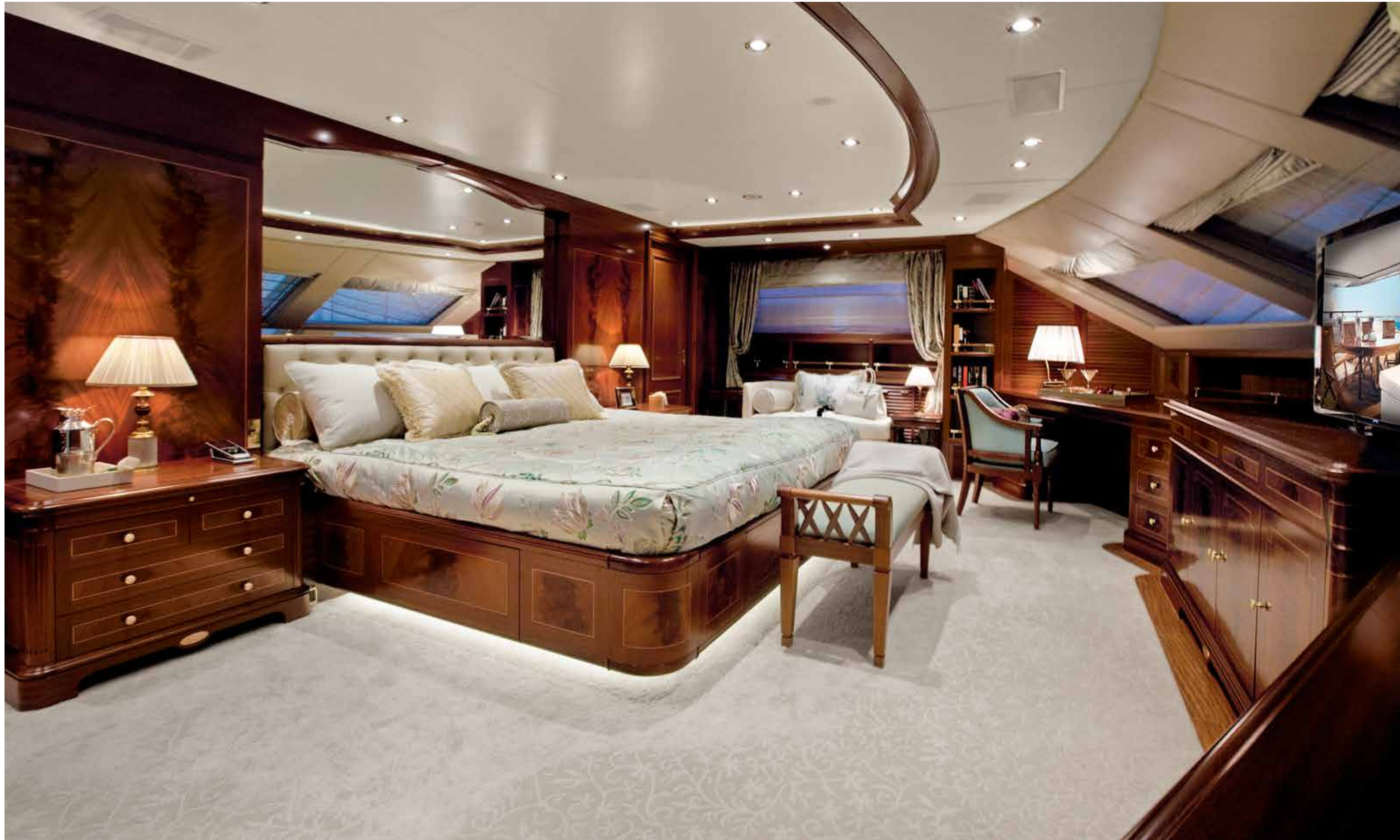
Main Deck Owner's Cabin