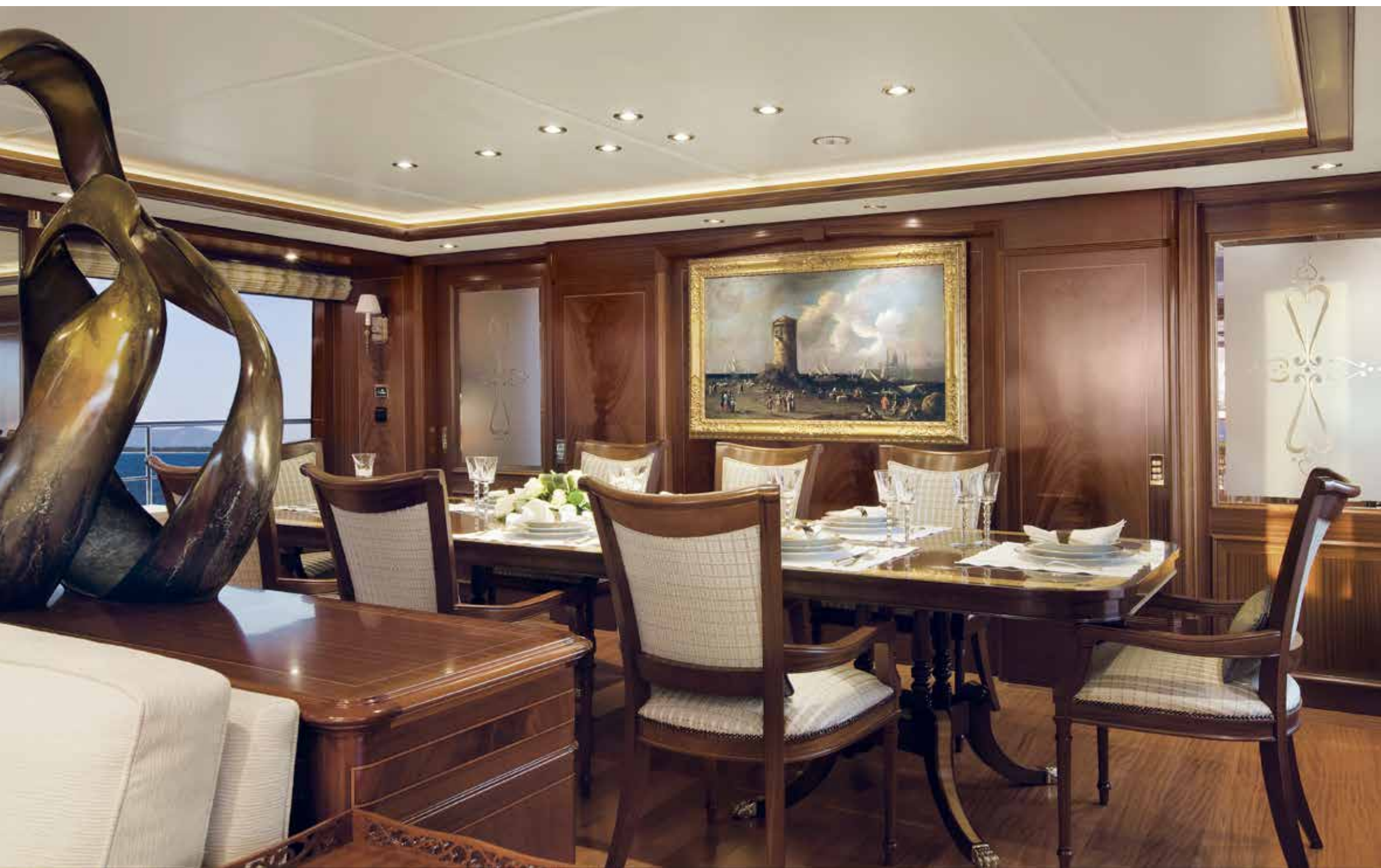
Main Deck Dining Area • Previous page: Main Deck Main Saloon