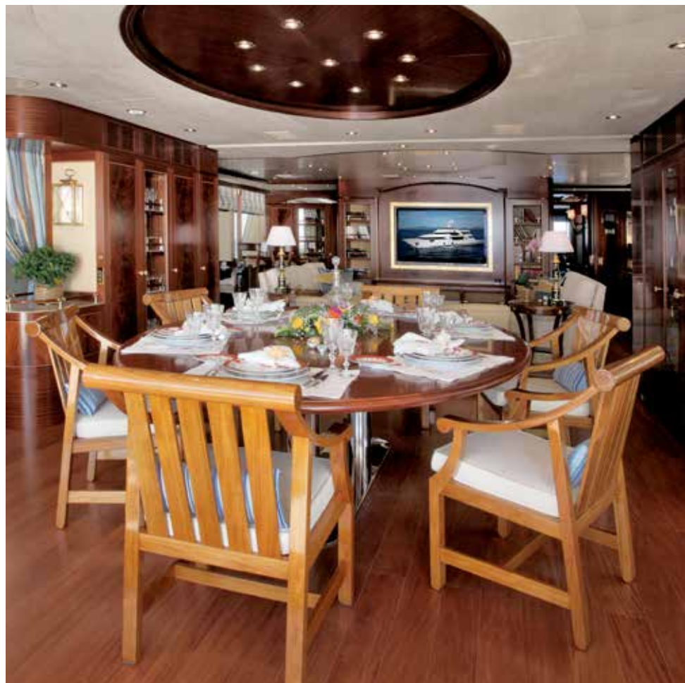
Upper Deck Dining Area