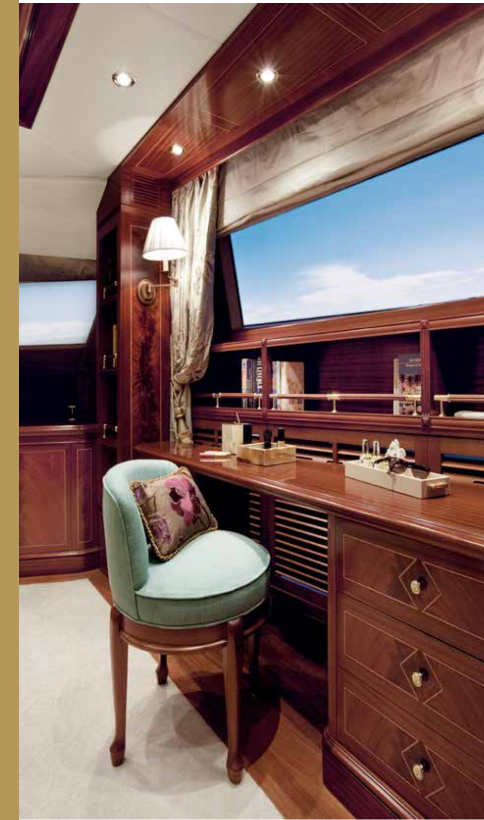
Main Deck Owner's Cabin

Every detail, even the most hidden, bears witness to superior quality and fanatical attention to detail. The master suite is fitted with security cabinets and wardrobes with internal compartments. The elegant vanity area is adorned with a blind that can be raised to extend the sea view exponentially.