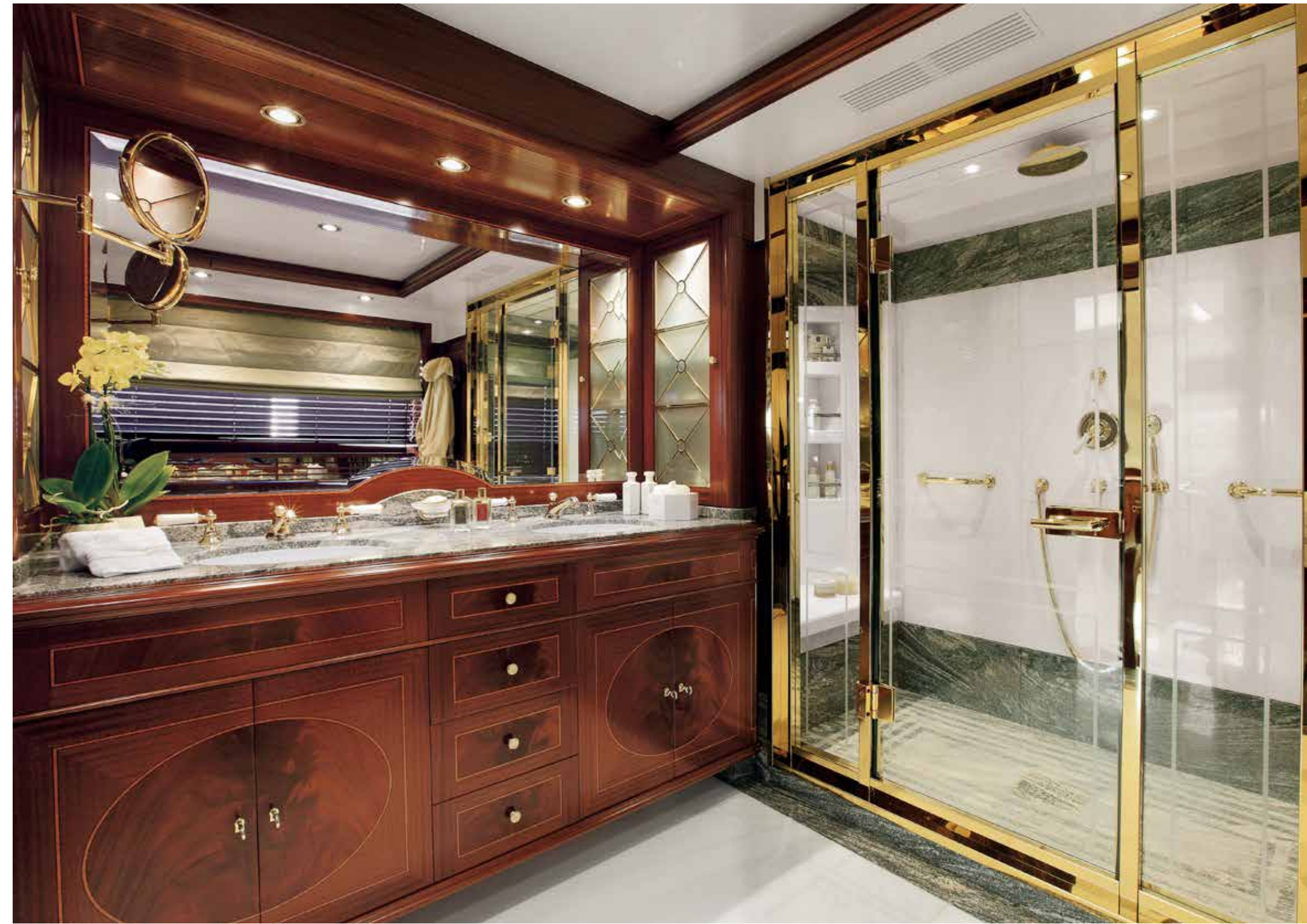
Main Deck Owner's Bathroom

Every detail, even the most hidden, bears witness to superior quality and fanatical attention to detail. The master suite is fitted with security cabinets and wardrobes with internal compartments. The elegant vanity area is adorned with a blind that can be raised to extend the sea view exponentially.